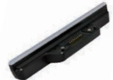
AWCSLED Light Bar