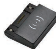
AWCSNFC NFC reader