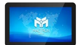
10.1" Second Display