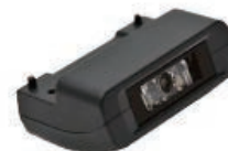
AWCS2DS Barcode scanner