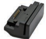
AWCSMSR MSR Module