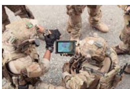
Military Equipment/ Outdoor Exploration