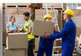
Storage Material Management