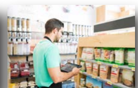
Retail/ Market/ finance