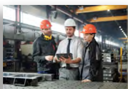
Industrial Operating System