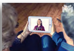
Remote Mobile Medical Service