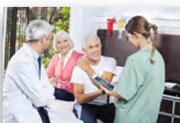
Medical & Healthcare