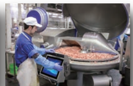
Animal Feed Production