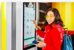
Amusement and Entertainment Device