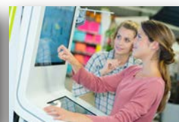
Interactive Digital Signage