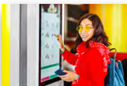
Amusement and Entertainment Device