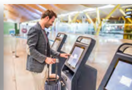
Smart Cities Terminal