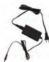
ADA12D0 Power Adapter