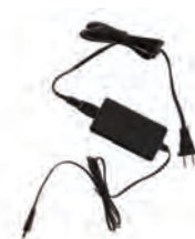
ADA12D0 Power Adapter